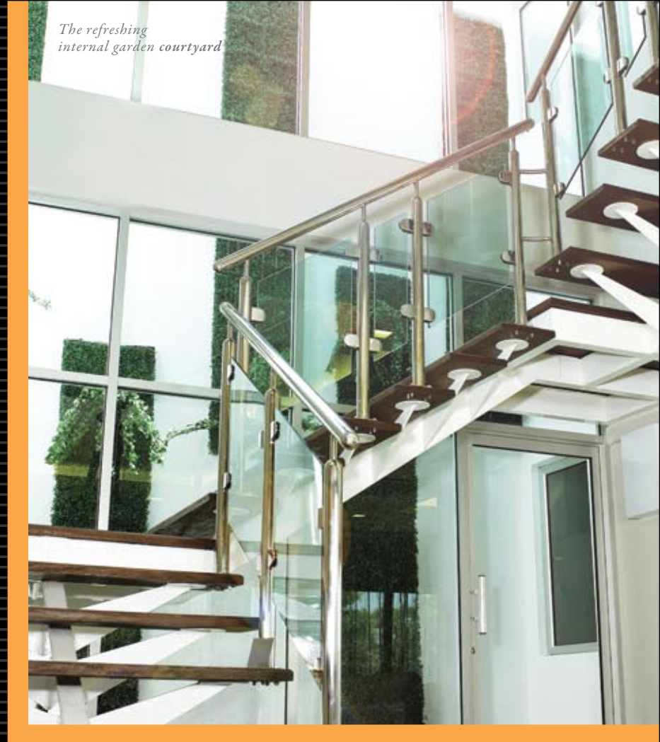
The refreshing internal garden courtyard

THE SUPER LINK WITH AN INTERNAL COURTYARD